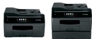
Lexmark OfficeEdge Pro5500 Lexmark OfficeEdge Pro5500t

► Visit smartsolutions.lexmark.com to learn more and access Lexmark SmartSolutions. You can also find up-to-date application compatibility information at this website.