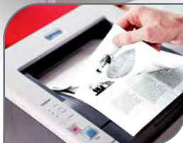
Fast and Efficient