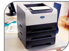
Expandable paper capacity for cost-savings