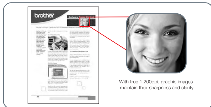
With true 1,200dpi, graphic images maintain their sharpness and clarity

* For HL-5250DN only. HL-5240 comes with standard 16MB upgradeable to 528MB.