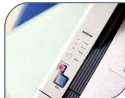
3-colour LED gives instant status recognition