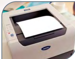
A range of printing functions to make office life easier