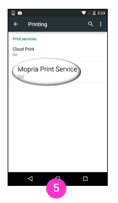
Tap Mopria Print Service.