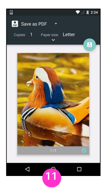
Tap the printer's name.

Tap Print. If there is no Print option, the app may not be Mopriacompatible. Share, Open, View, or Export the image to the Mopria Print Service app.