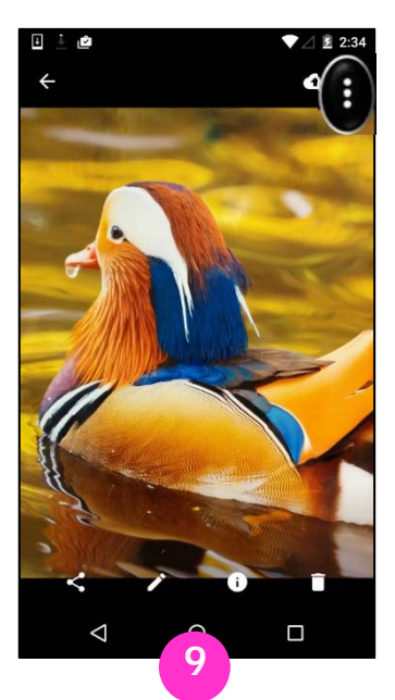
For Chrome users: Open the Chrome app and tap the menu icon.