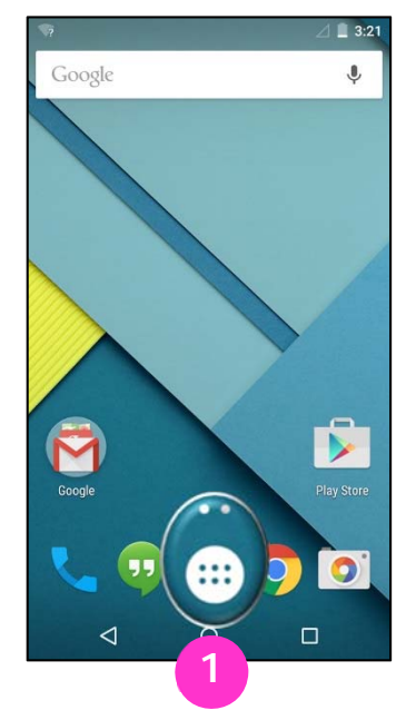
On the home screen, tap the Apps icon.