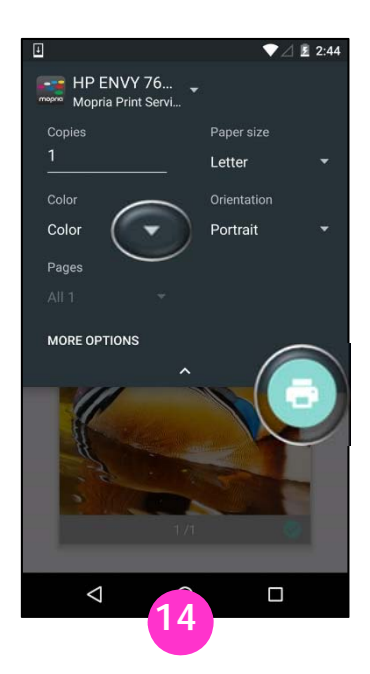
To confirm or change print settings, tap the drop-down icon. Apply your print settings and tap the print icon.