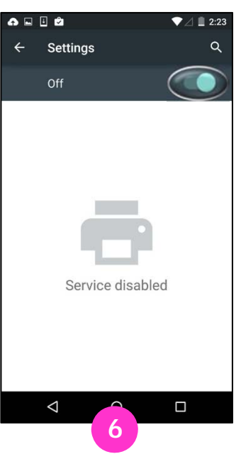
Slide the toggle button to the On position .

view your options, and look Wireless, More Networks, o More connection settings.