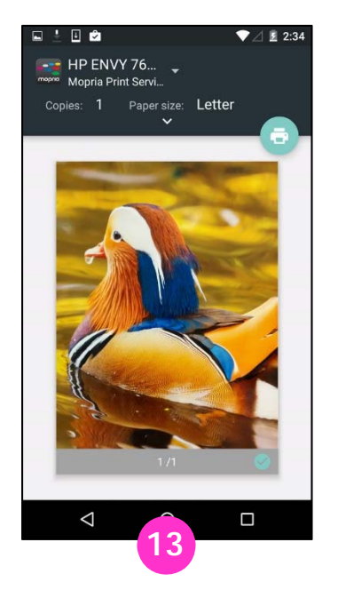
Tap one of the printers in this list to select it.