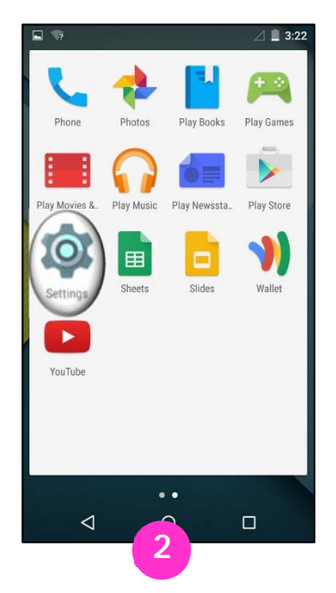
Tap the Settings icon. You can also swipe down from the top of the screen to access the Settings menu.