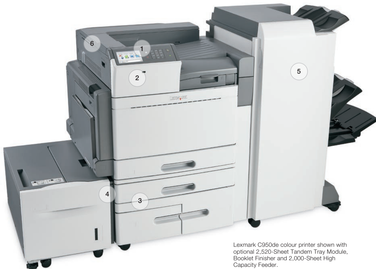
Lexmark C950de colour printer shown with optional 2,520-Sheet Tandem Tray Module, Booklet Finisher and 2,000-Sheet High Capacity Feeder.