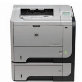
HP LaserJet Enterprise P3015x Printer

• HP LaserJet P3015d: print speed of up to 40 ppm • HP LaserJet P3015dn: as d model with HP Jetdirect Gigabit Ethernet embedded print server