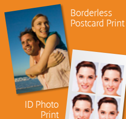
Borderless Postcard Print

Canon is dedicated to providing you with many different ways to share your memories. From Postcard prints to square stickers that are perfect for printing from mobile devices, there's a solution for everyone.