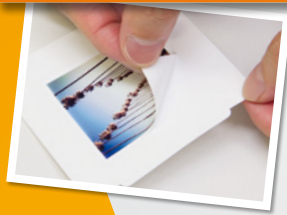
New square stickers